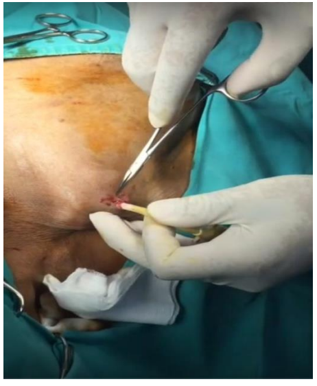
Figure 1: Dissection of the Dacron cuff

antibiotics (vancomycin and gentamicin) was initiated immediately after obtaining blood cultures from the catheter and peripheral blood (first culture). A definitive diagnosis of catheter-related bacteremia can be made when blood cultures obtained from both the catheter lumen and a peripheral blood (in patients with clinical symptoms of sepsis in the absence of any other noticeable source of infection) grow the same