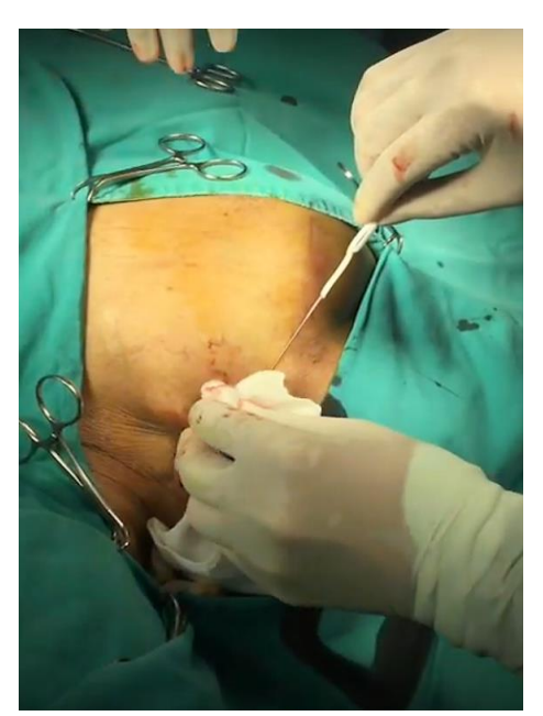
Figure 3: New catheter insertion over guidewire

Cure: defined as a 45-day symptom-free interval after completion of antibiotics in addition tonegative blood culture at least 1 week after completion of antibiotic therapy. Treatment failure: Any bacteremia