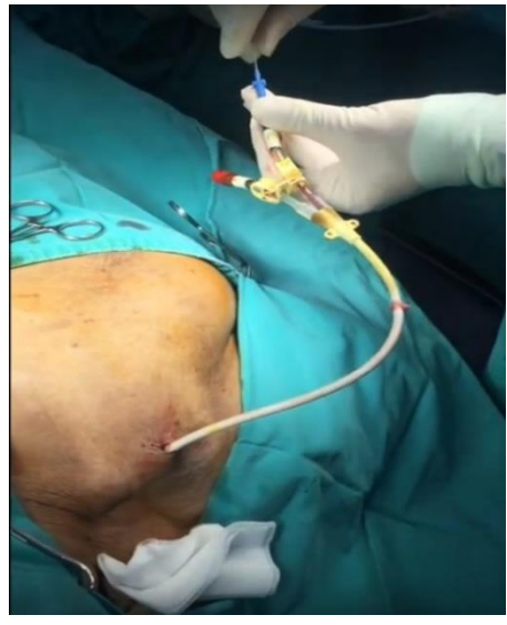
Figure 2: Removal of infected catheter

A repeat blood culture was obtained 7 to 10 d after completion of antibiotic therapy (third culture).