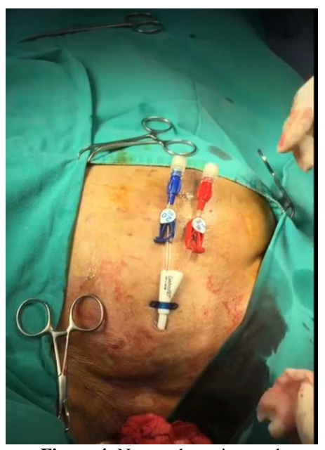
Figure 4: New catheter inserted

involving the original organism that occurred within 45 d of initial treatment. Indeterminate result: If the patient died, the catheter was removed for an unrelated reason before the end of the 45-d period, or if the recurrence of infection was with a different organism.