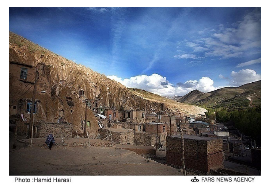
Photo 1: View of the tourist village Kandovan

in the village at 2,300 meters above sea level, 37 degrees 48 minutes north latitude of the equator and 46 degrees and 15 located minutes east of the prime meridian. Kandovan village, along the river towards the hive and west - east to the stairs on a steep slope into the prevailing wind direction in this area, is west to east. (Statistical Center of Iran, 1996).