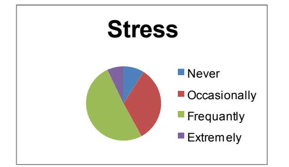
Mean 182.22 P = 0.000