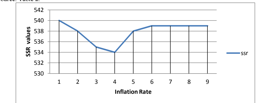
Figure (3) The relation between Sum Square of Residuals (SSR) and virtual inflation rates.