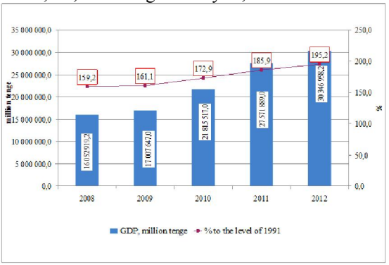
Figure 1. Real GDP dynamics

The results of 3 years of SPAID implementation were as follows: for the first time the share of processing industries in GDP has reached 22,5%. And the rate of growth in processing sector is higher then the growth of mining industry. For example, in 2012 increment in processing industry was 0,7%, in mining industry -0,2%.