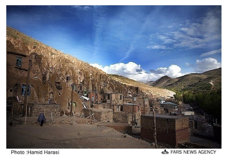
Photo 1: View of the tourist village Kandovan

located in the village at 2,300 meters above sea level, 37 degrees 48 minutes north latitude of the equator and 46 degrees and 15 located minutes east of the prime meridian. Kandovan village, along the river towards the hive and west - east to the stairs on a steep slope into the prevailing wind direction in this area, is west to east. (Statistical Center of Iran, 1996).