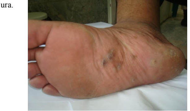
Figure 1: Nodular sinus lesions containing pus and granular grains

Actinomycetoma was confirmed by aspiration of the pus and granule from abscess and direct examination, culture as well as biochemical tests (Figures 1-4). The smear was negative with Ziehl-Neelson (Acid fast staining) and PAS staining, but positive with gram and Gimenez staining and gram positive filamentous bacteria was observed. After growth in BHI broth (Brain heart infusion broth) and Chocolate agar, the biochemical tests were done, the results of which are followed in Table 1. All tests showed that the causative agent of mycetoma was Actinomadura Mad