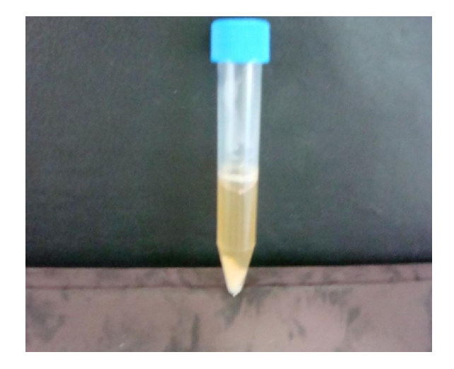
Figure 3: Growth of Actinomycetoma on BHI broth medium