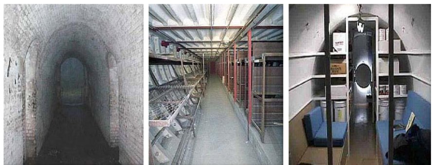
Figure 1 - Sample Refuge From left to right: Family Shelter, modern sanctuary, a haven of old