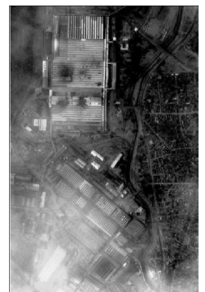
Figure 1 - Target being a weapons factory during the war in Kosovo in 1999 Zstava

that are adjacent to residential areas, it is not possible to target the health center and get them to come [5].