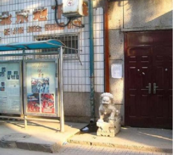
Figure 4 - the basement entrance of the city's public spaces in cities near Beijing