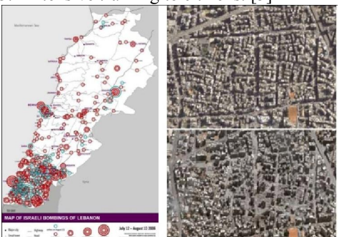
Figure 5 - Distribution of Israeli air attacks during the 33-day war, the residential areas Dahyihe In the south of Beirut, before and after the bombing of 22 July 2006