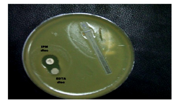
Figure (2): Double disc synergy test of an imipenem resistant Pseudomonas isolate

C- Molecular identification of imipenem resistant gene, (MBLs gene IMP type, bla<sub>IMP</sub> gene) using conventional PCR, according to Senda et al ; (1996). Template DNAsextraction: each isolate were heated in a hot block at 96°C up to 10 minutes, then were placed on ice for 5min