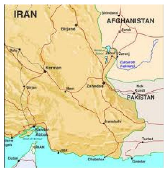
Figure 3. Map of sistan