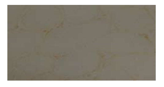
Figure 3. The testis of male normal rat (negative control) ( \times 400). This is PBS instead of first antibody (There were no AR positive cell in the testis of rat).