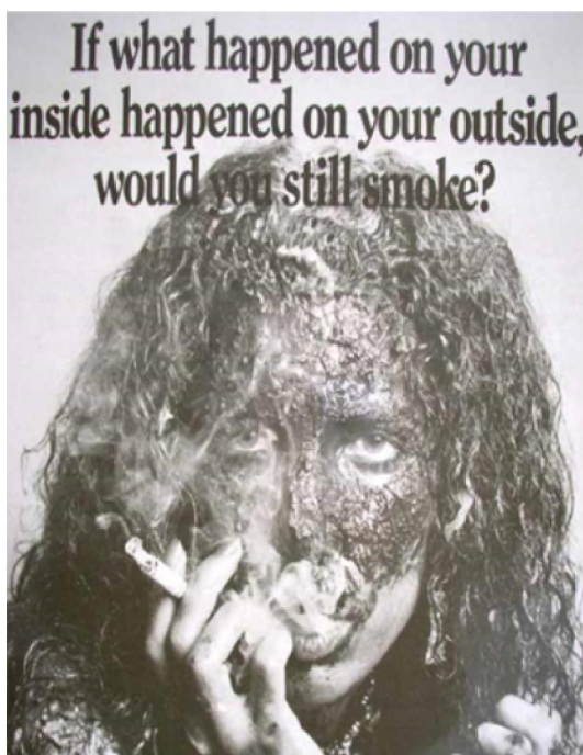
Fig 3: Poster