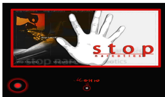
Fig 1. The anti-drug poster

The approval of electronic systematic complex was accomplished by students of specialties “Medical biochemistry” and “Biology” in the process of organizing of the educational activities with the schoolboys and students of other departments of the North-Caucasian Federal University (Stavropol) and Stavropol State Agrarian University and also with the teachers of educational establishments of Stavropol and the Stavropol region. As a result of analysis of the results of approval, we came to the conclusion that the complex can be used in various forms of training and educational process. Teachers highly estimated the educational possibilities of the complex and use it effectively both on the lessons (biology, chemistry) and in the process of taking educational measures. The obtained results indicate the relevance of the complex.