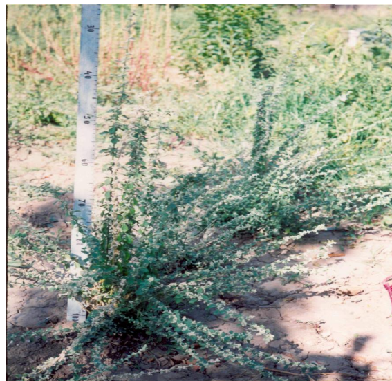
Figure 1 - Aervalanata ( L. ) Juss. in blossoming phase

[29]. The morphological description of plants was carried out with animate material with the account of works of I.P. Serebraykov [30], A.A. Fedorov, and others [31-34].