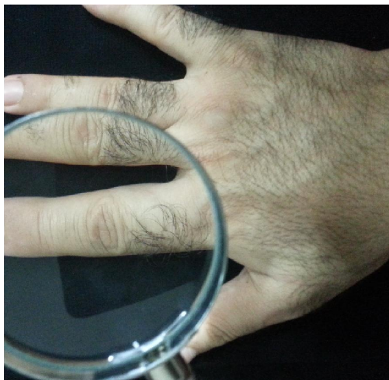
Fig. (1): hand examination for dorsal phalangeal hair using magnifying hand lens.

Hair distribution on the dorsum of middle phalanges of the hands of both male and female participants in the present study is shown in Table (2) and graph (2) . Hair was present on the dorsum of the middle phalanges of 46% of males and 38% of females. The most common combination of fingers with middle phalangeal hair was 34 (13.33% and 14% in males and females respectively), followed by the combination 4 (11.67% and 11% in males and females respectively). The least common combination in males was 5 (1%) while in female hands the least combination was 45 (0.33%). No significant difference between male and female contributors ( P = 0.622 ).