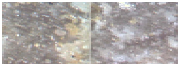
Fig. 2. Optical microscopic pictures from abraded surface of base sample SR (left) and SR-0.5C (right).

Beside the SEM image from abraded surface of nanocomposites, the optical microscopic pictures have been captured from abrasion surface of rubber/resin/nano Aluminum oxide nanocomposites. In figure 2, optical graph from abraded surface of base sample Styrene Butadiene rubber / Phenolic resin Compound (SR) and SR-0.5C compound which has 0.5 phr nano aluminum oxide have been brought.