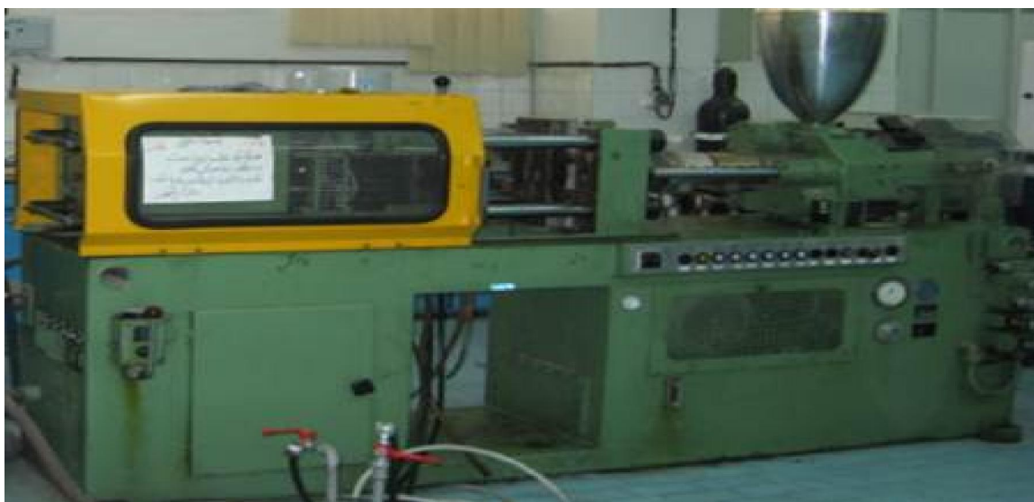
Fig.1: Extruder machine used in this study. As the processing method, a twin-screw extruder has been used. The extruder with operation temperature of 220 C has been used for extruding the nanocomposite polymeric samples.

As the processing method, a twin-screw extruder has been used. The extruder with operation temperature of 220 C has been used for extruding the nanocomposite polymeric samples. The process is conducted by the extruder which is shown in the Figure 1. Since the nanomaterials have a tendency to agglomeration, a well-performed extruding process is necessary and was conducted to achieve a well-dispersed compound.