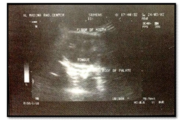
Fig (6). Ultrasound showing tongue position in healthy (non cleft) infants