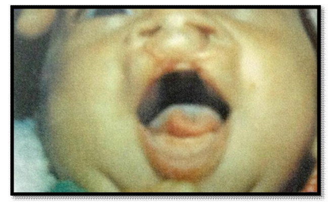
Fig (1). cleft lip and palate infant

Fourteen infants were selected for this study from pediatric clinic-Tanta University, seven infants had cleft lip and palate and seven were non-cleft infants. Their age ranged from 3-12 months. (Fig. 1)