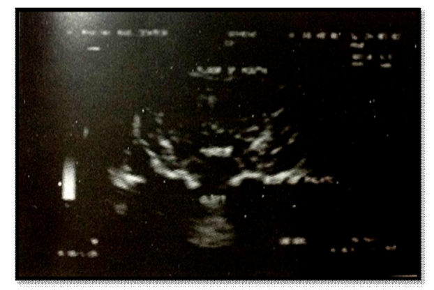
Fig (5). tongue inserted in the cleft palatal area

Palatal Area. (Fig. 5) Ultrasonic Scan For The Non Cleft Palate Infants Is Shown In Figure (6)