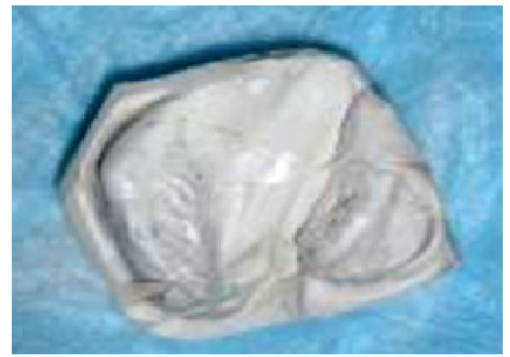
Fig (3). working cast for cleft palate infant