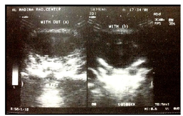
Fig (7 a & b). Tongue is in its adequate position.

After the insertion of the prosthetic palatal plates the tongue retracted to its adequate position. (Fig.7 a & b)