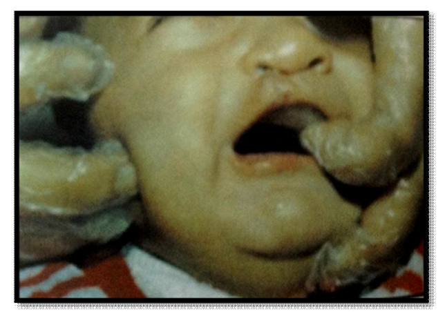
Fig (2). silicone rubber impression

Silicone rubber impression (Speedex, Coltene A.G., Alsatten, Switzerland) was made for the maxilla with the cleft palate area. The impression material was pressed to the convex surface of spatula and molded to the shape of a block of the needed size, and then it was inserted into the baby's mouth to the back of the pharynx with a light upward and forward movement. After setting of the impression it was taken out of the cleft by first moving the spatula from front to back and then downward and forward. (Fig. 2)