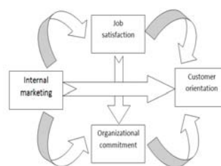
Fig 1: Conceptual model of research

To express the relationship between variables, conceptual model was used in this study. This model which is an adaptation of Liao research (2009) is shown in Figure 1.