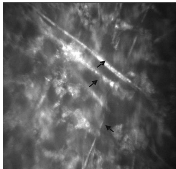
Figure 2. The long line hyper-reflective structures ( \times 1000 ).