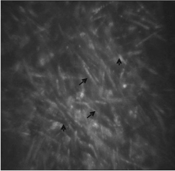
Figure 3. The short rod hyper-reflective structures ( \times 1000 ).

Table 1 summarized the spectrum of thirty-eight eyes of 38 patients. Four genera were involved in this group of patients, including 18 (47.5%) isolates of fusarium species.